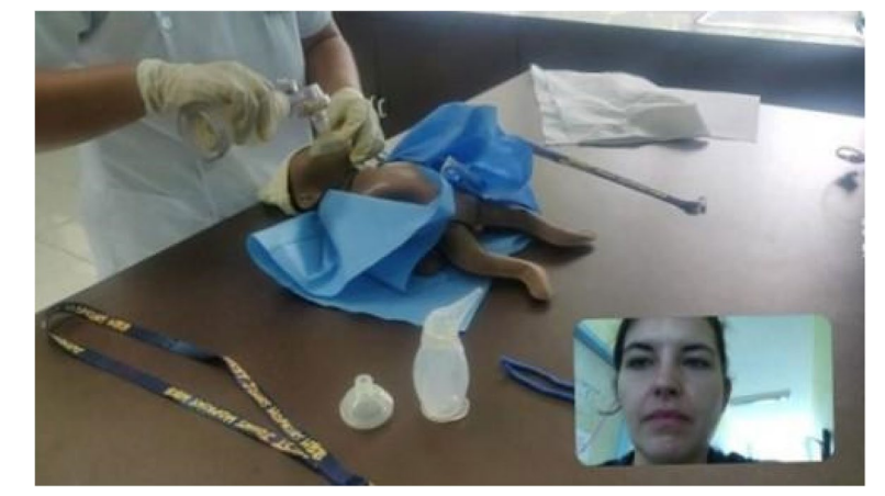
Fig. 2 Screenshot of tele-simulation showing participant and instructor during practical examination

Initial differences in outcomes between study groups and improvement after training are shown in Table 1. No significant differences were detected between groups for baseline mean time to initiate ventilation, knowledge