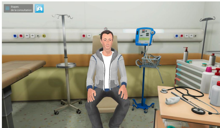
Fig. 1 Screenshot of the virtual patient