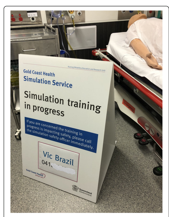
Fig. 3 Example of simulation safety signage

8. Develop a reporting process for simulation related adverse events or near misses, preferably integrated